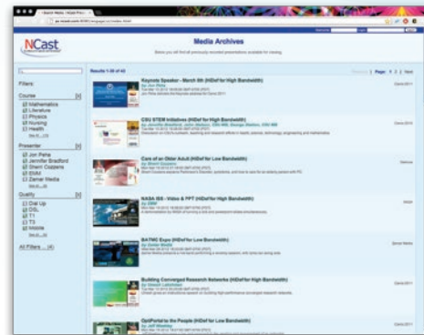
Media Gallery for viewing recorded streams.

Unlike other video content management systems, the Presentation Server has facilities for dealing with both the video aspects of a presentation (e.g. a camera shot of the presenter) and the graphical aspects of a presentation (e.g. capture of computer screens, PowerPoints, Keynotes and similar demonstration materials used by the presenter).